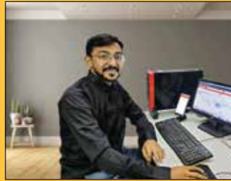
Stock Market Analyst