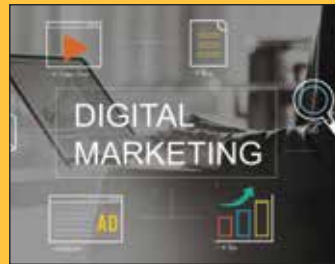
Digital Marketing Specialist