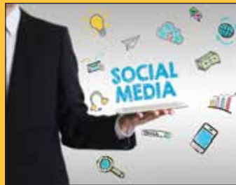
Social Media Manager