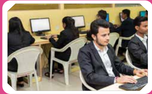
Hi-tech Computer Centre