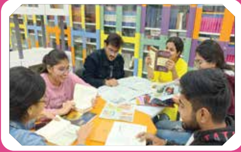
The Knowledge Hub